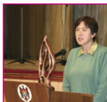
■ Antonesti village, Stefan Voda