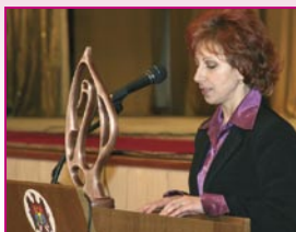
■ Crihana Veche village, Cahul