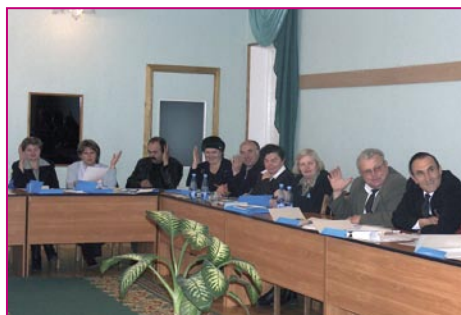
Training on Case Study Writing for BPP participants

Besides the innovative practice, the LPA have to prove excellence in one of the three themes , by fulfilling the criteria and confirm their willingness to disseminate their best practice to other local authorities .