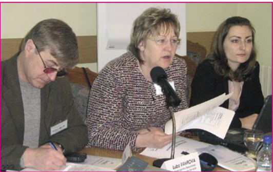
Local and international experts participating at first Steering Group Meeting in October 2007