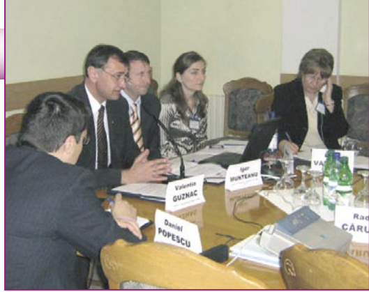
First Steering Group Meeting in October 2007

The project is funded by Council of Europe, Institute for Development and Social Initiatives (IDIS) "Viitorul" ensures the administrative support and logistical framework for the BPP.