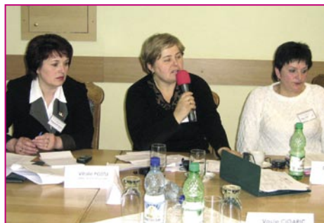
Mayors participating at Steering Group Meeting

Administration, from the local public authorities' perspective, is more than just management. They participate in the decision making process even before the beginning of an administrative process, and their work continues after the end of this process. Local public authorities identify the priority needs, participate at strategy elaboration, at identification of specific public services, at costs evaluation and funds identifying, analysing the citizen co-participation rate and contribute directly to improve the process and the performances.