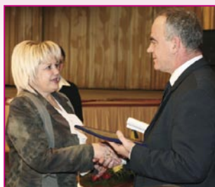
■ Iujnoe village, Cahul

3 mayoralties have been distinguished with Honourable Mention and a set of professional books: