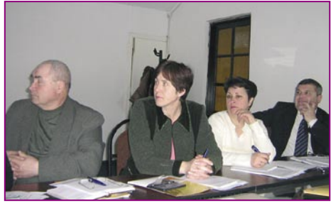
Best Practice Authorities participating at training programme on dissemination skills