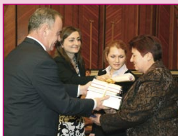
■ Larga commune, Briceni