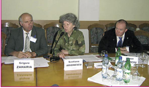
Members of Steering Group Meeting