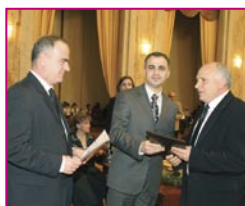
■ Chetrosu village, Drochia