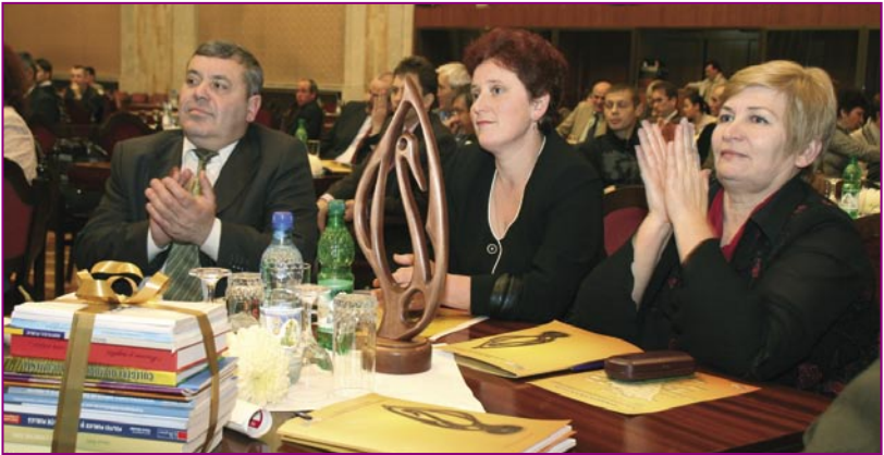
Mayors participating at BPP National Awards Ceremony in November 2007

the Council of Europe in 2005 in co-operation with local government Associations, central Government, the USAID Local Government Reform Project and other stakeholders. It is aimed at identifying, publicly recognizing and disseminating of best practices among local authorities in Moldova.