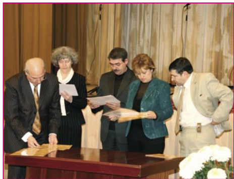
Members of Selection Panel handing diplomas

After being visited, the representatives of short listed local authorities shall be invited to present their best practices to the Selection Panel and the Steering Group of the Project at a meeting held in the end of August 2008. Based on their presentations and on the conclusion of verification visits, the Selection Panel and Steering Group members shall make the decision on the 6 local authorities to be awarded the