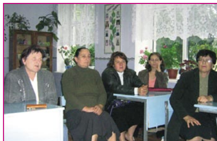
Evaluation visit in Chetrosu village, Drochia