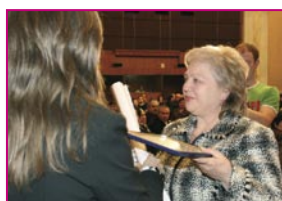
■ Ciocalteni village, Orhei