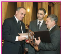
■ Galesti commune, Straseni

During the second round of BPP, in 2007 6 best practices that were awarded during the National Awards Ceremony with Diplomas from Ministry of Local Public Administration, a computer and a set of professional books from Council of Europe.