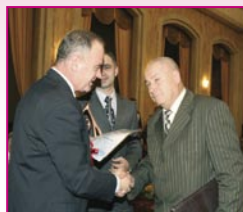
■ Pohoarna village, Soldanesti